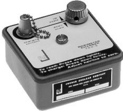
Model JN 750-5 (Jordan Nuclear) (Battery not included)