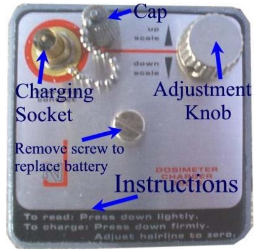
Jordan Charger Model 750-5